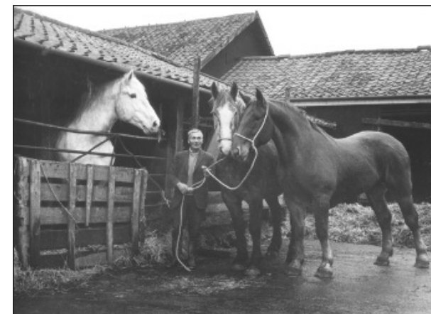
Roger Peacock's stable at Morley in 1975.