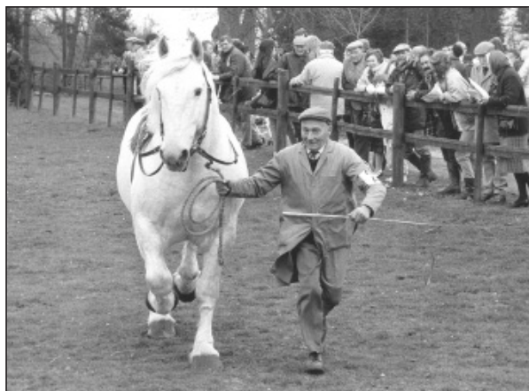
Lime Claude at the Kimberley Show in 1991.